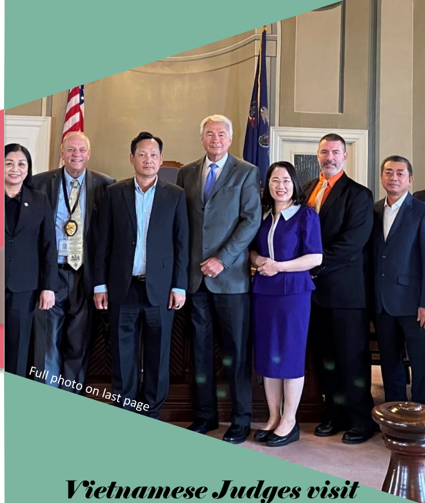
Full photo on last page